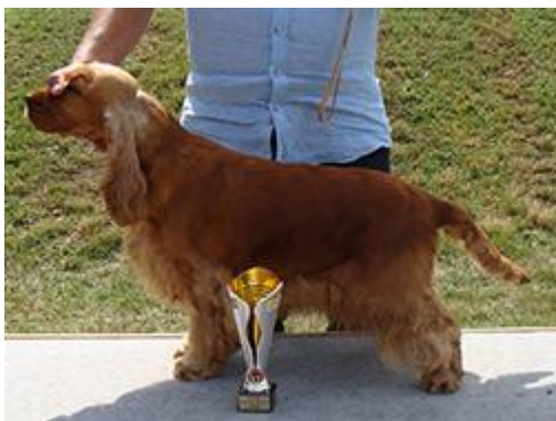
Bella Molly Monet