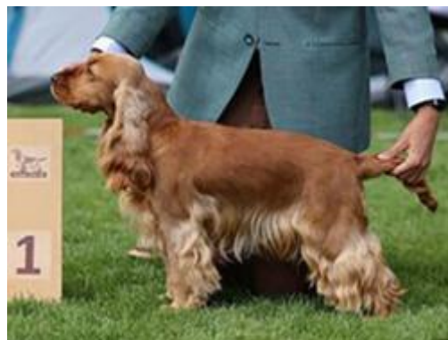
Aurora Molly Monet