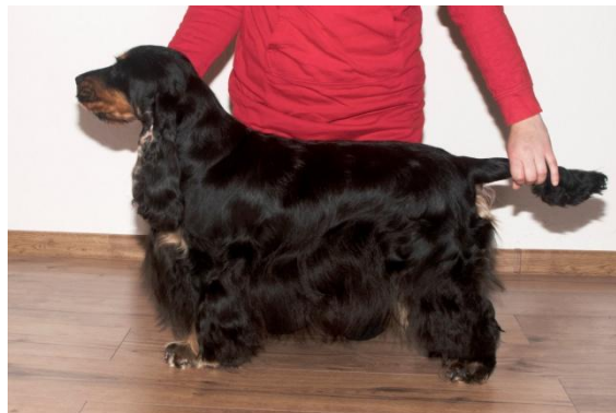
Precious Pearl of English Lady