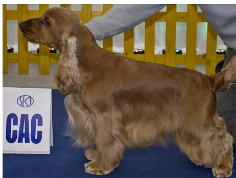
3th place Ludwig z Vejminku o: Škrabák Vladimír